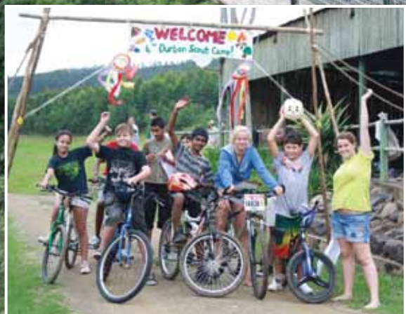
4th Durban about to set off on a challenging mountain bike ride.

4th Durban scouts cross the suspension bridge at the top of Oribi Gorge while on a hike.